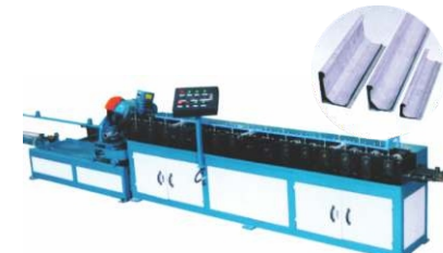
Mate / Slip-on