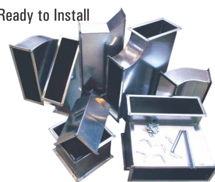
Ready to Install