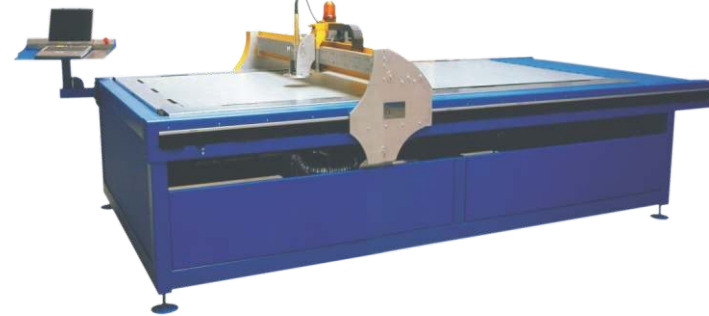
CNC Plasma Cutter for fittings