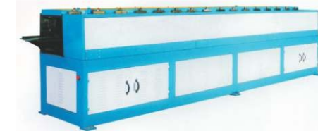
C & S / C & Standing S