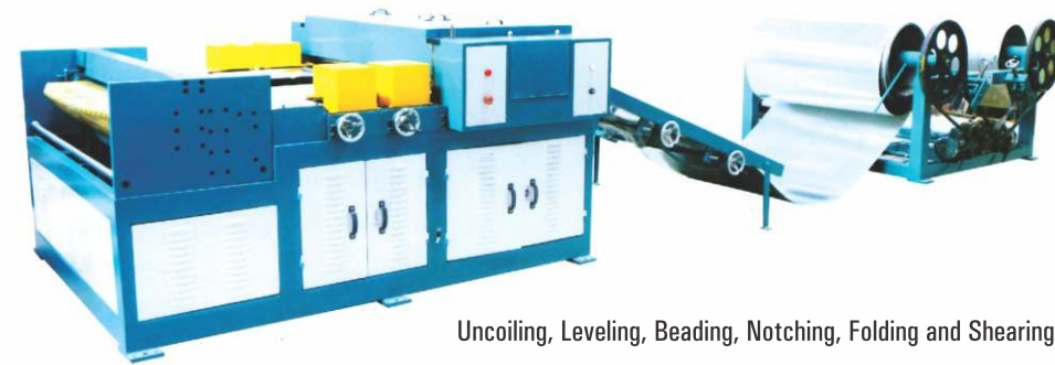
Uncoiling, Leveling, Beading, Notching, Folding and Shearing