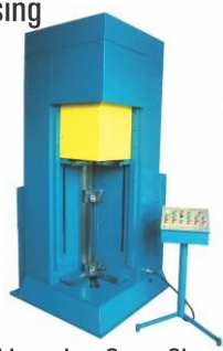
Whisper-Loc Seam Closer